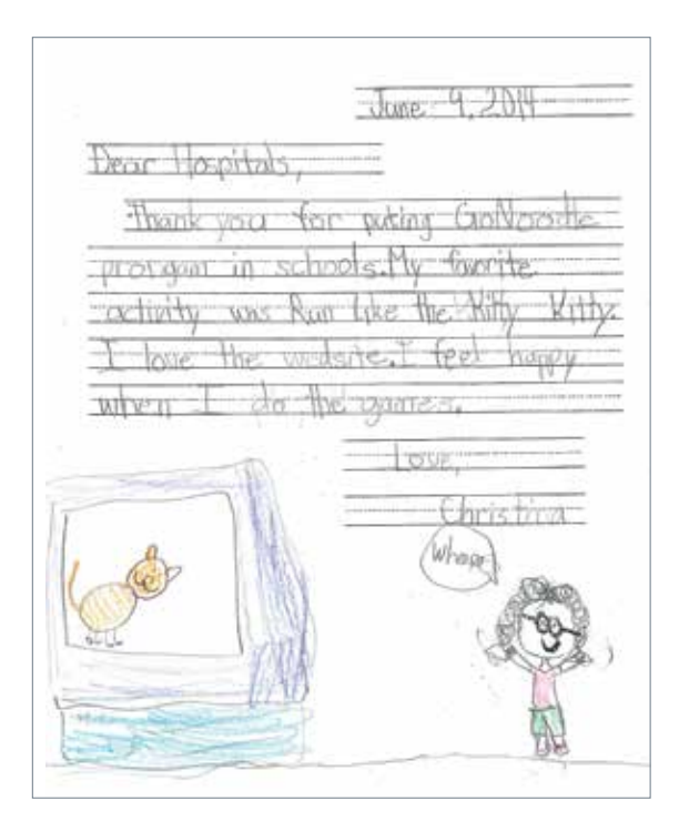
A letter of gratitude from a satisfied student who used the GoNoodle (HealthTeacher) program.

This online health education curriculum gives K – 12 teachers tools to incorporate crucial health information into the day's learning. HealthTeacher educates students about the importance of exercise and good nutrition and encourages them to avoid risky behaviors such as alcohol consumption and tobacco use. This year HealthTeacher was expanded to include GoNoodle, a suite of web-based games designed to encourage physical activity and relaxation breaks in elementary classrooms. Research has shown that these short bursts of physical activity—"brain breaks"—have a positive impact on academic achievement, overall health, cognitive skills, and behavior. The brain breaks feature cartoon characters and Olympic athletes who guide the kids through breathing, stretching, and energizing exercises. Teachers have a choice of brain breaks, depending on whether the classroom needs to be calmed down or invigorated.